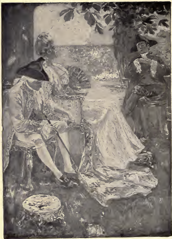
IN THE GARDEN AT TEMPLE BOW.